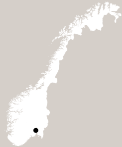
Storo Storsenter, located in north Oslo, is the city's leading shopping centre.