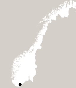
Sørlandssenteret is a large shopping centre in Kristiansand.